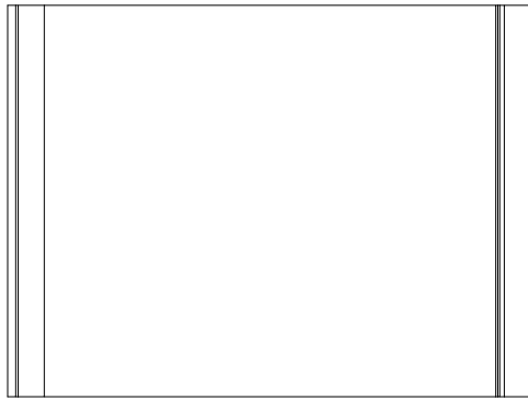
PLAN VIEW (NOT TO SCALE)